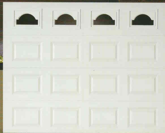
9' x 7' 2255 white with optional cathedral window inserts