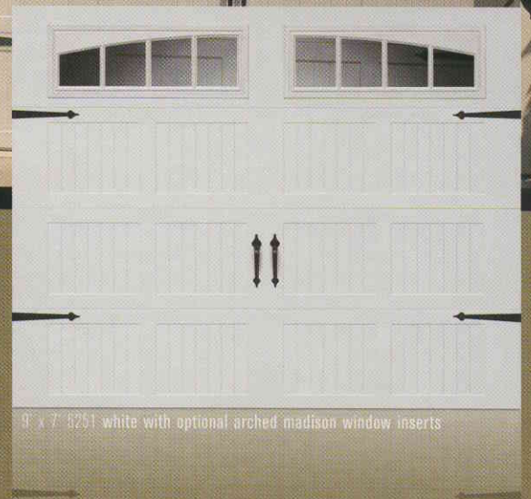
9' x 7' 5251 white with optional arched madison window inserts

* Calculated in accordance with ASHRAE standard formulas