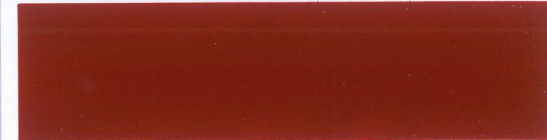
*Barn Red (.278)