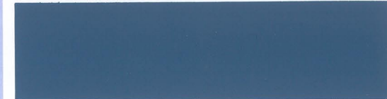
*Slate Blue (.31)