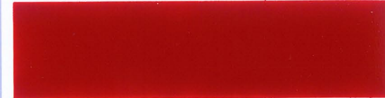
*American Red (.328)